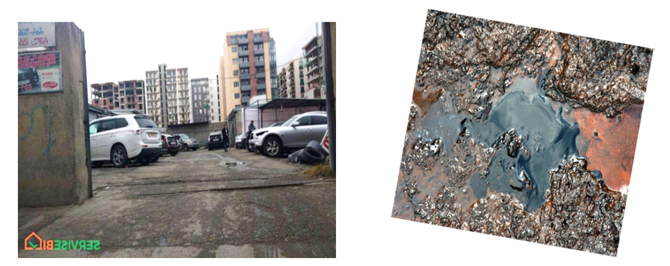
Fig. 1. Automobile workshops, near populated areas across Tbilisi

ment Many shale oil products consist of organic compounds that can cause high toxicity to soil, organisms, and humans. The term "toxic elements" (TEs) refers to heavy metals, because of their nucleon number and/or high density [1].