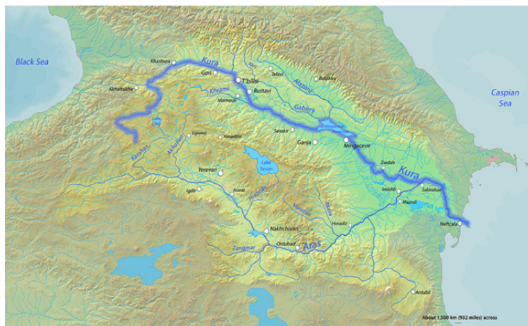
Fig.1. River Mtkvari basin.

The river is now moderately polluted by major industrial centers like Tbilisi and Rustavi and it is now much slower and shallower, as its power has been harnessed by hydroelectric power stations in Georgia.